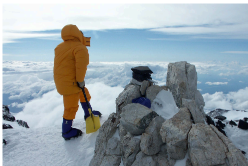
Above: The weather station in 2006, located at 18,734 feet.